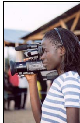
FILMAID Aspiring Filmmaker, Kakuma, Kenya.