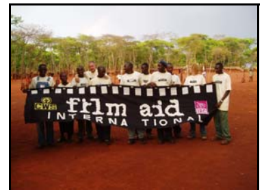
FILMAID FilmAid Staff in Tanzania.