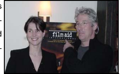
FILMAID Julia Ormond and Richard Gere at a FilmAid event