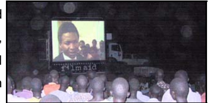
Evening screening, Kakuma, Kenya.

The Constant Gardener , a film directed by Fernando Meireilles ( City of God ) and starring Rachel Weisz and Ralph Fiennes, was shot recently in Loiyangalani, amongst other locations in Kenya. FilmAid, in collaboration with the cast and crew, held a special screening for the local community of Turkanas and El Molo in Loiyangalani, including raw footage from The Constant Gardener and the film Yellow Card . It was a wonderful occasion for everyone; children danced for hours before the screening and at the party afterwards, two thousand Kenyans from the local community celebrated late into the night with Ralph Fiennes and others from the cast and crew.